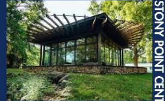
STONY POINT CENTER