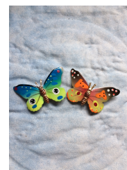
SPREAD YOUR WINGS

AT THE HIGH PEAKS RESORT, LAKE PLACID, NY